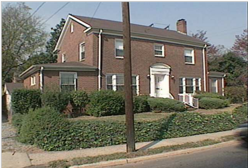
1327 Beatties Ford Road

There is a small collection of substantial early-twentieth-century two-story houses along Beatties Ford Road near the historically black West Charlotte High School (former). These houses have not been thoroughly surveyed and are mixed with numerous post-World War II houses. Some of the houses are in poor condition, and others have suffered some loss of integrity due to road widening. One example that may possess enough special significance to merit historic landmark status is the house located at 1327 Beatties Ford Road.