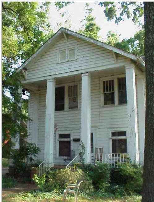
Arthur S. Grier House

Located in the historically black Grier Heights neighborhood, the Arthur S. Grier House is comparable to the Dr. Greene House in terms of both associative and architectural significance. However, the Grier House is now in poor condition.