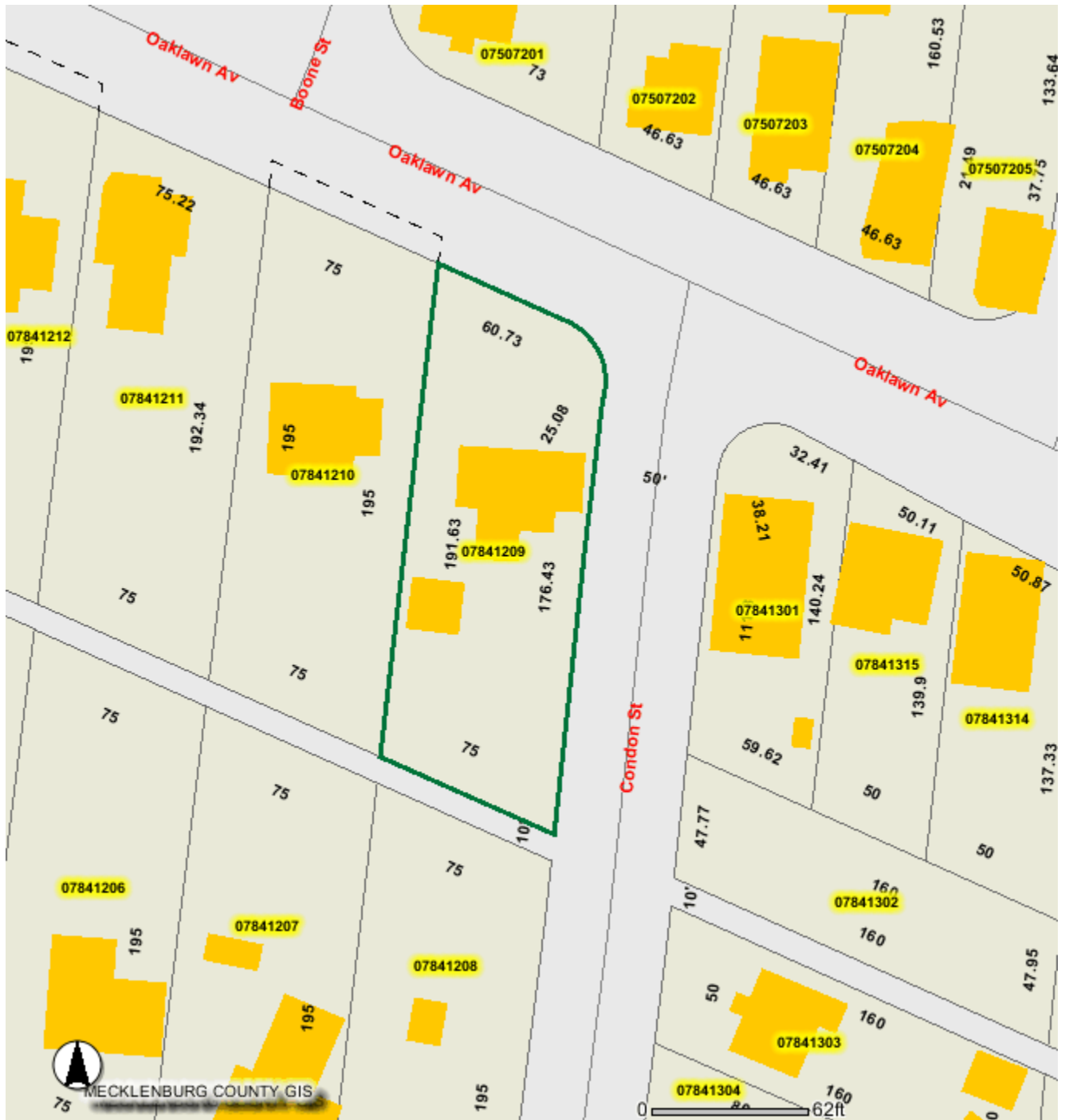
Mecklenburg County Tax Map