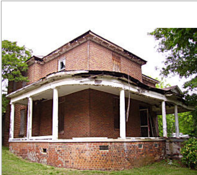
Dr. George Davis House