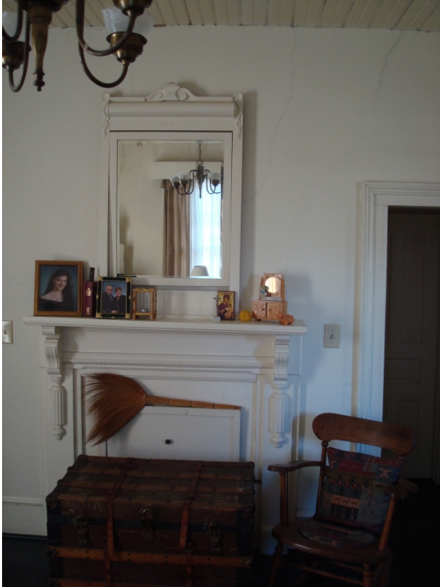
2nd Floor Bedroom Mantle

Folk Victorian houses combined simple, traditional folk house forms like the I-house and the hall and parlor—which were familiar to builders and to homeowners—with easily applied decorative detailing. Usually this ornamentation took the form of spindlework around porch columns or verge board underneath gables. While the effect was a far cry from that achieved by the multiple textures, delicately integrated detailing, and irregular form of a true Queen Anne house, Folk Victorian dwellings allowed farmers and rural families to have the familiarity of a traditional, symmetrical form with detailing similar to that seen on more expensive, high-style houses.